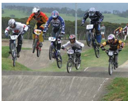
Supernats—Sunday, July 10 at Blair Oval