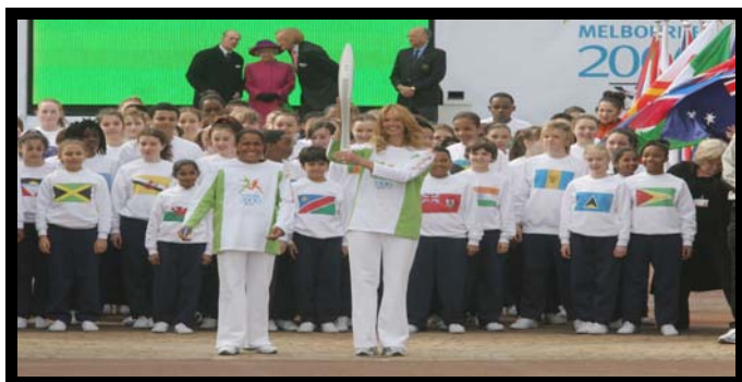
Cathy Freeman and Elle McPherson at the start of the relay outside Buckingham Palace, London.

The Relay Community Runner Nomination Program was officially launched at the Regatta Centre and nomination forms can be collected from Telstra Shops, the Telstra Country Wide office or at www.queensbatonrelay.telstra.com . Nominations close on September 9, 2005.