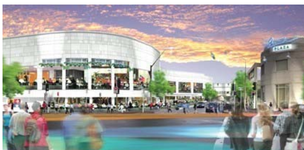
An artists impression of what the Penrith Plaza development will look like.

Work on the Penrith Plaza Development continues in earnest!