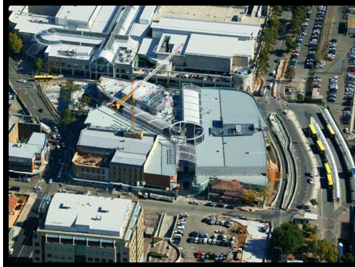
An aerial view of the Penrith Plaza redevelopment

The construction site that has intrigued customers and the broader Penrith community over the past 12 months is starting to develop a retail 'personality' as it enters the last phase of the construction process.