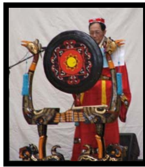
China Day 2005 at St Paul's Grammar

The project is attracting the lucrative educational tourist dollar to the region. When you consider the amount of time these delegates spend in the region and how much it is costing them to study, live and sightsee this is quite a considerable injection of cash into the Penrith Valley economy.