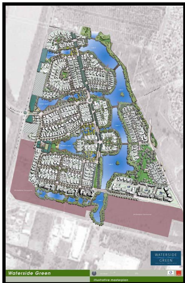
An artists impression of what Waterside Green will look like from the air.

Penrith Valley's newest and most exclusive address, Waterside Green will offer views of Penrith Lakes and the Blue Mountains.